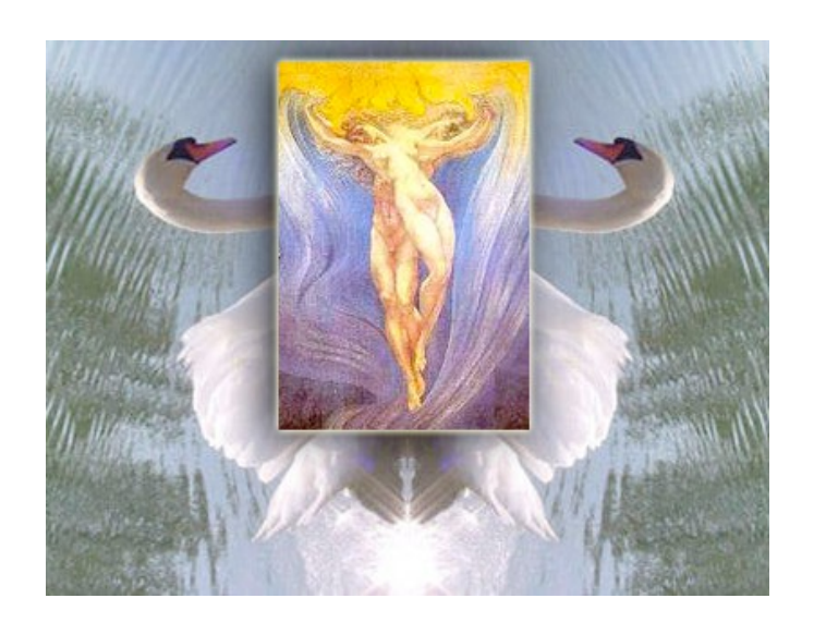
Solar Oils with "Unique Solar Elixir", "Huiles Consolatrices ADEVAYA" with "Elixir Consolateur Unique"