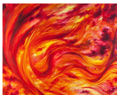
The Red Fire energy from red jasper...

The red jasper Magic Lingam is a powerful activator of energies and I would advise against use by those new to this type of practice.