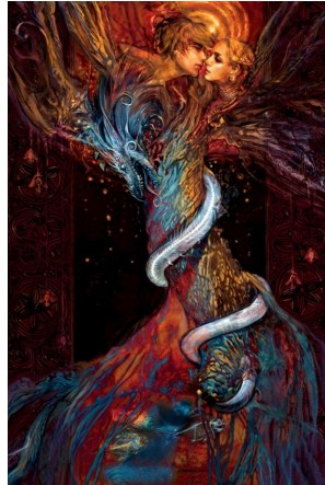
Semi-precious stone love energizing eggs Yoni Eggs

The Taoist tradition of yoga of Presence. Tantra: the path of unification and fullness of relations.