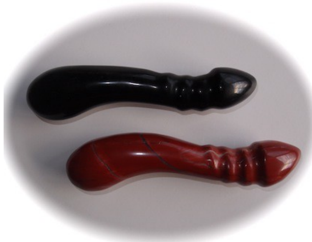
Carved semi-precious stone dildos The Magic Lingam®

It is my great pleasure to propose to you a line of energetic love eggs, also called Yoni Eggs , carved to my express design by Chinese craftsmen, thus allowing me to chose the dimension of the eggs as well as the quality of stone used.